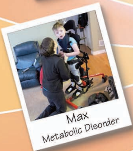
Max Metabolic Disorder