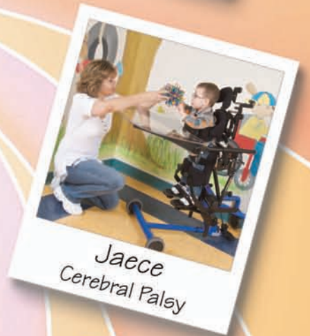
Jaece Cerebral Palsy