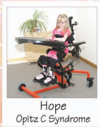
Hope Opitz C Syndrome